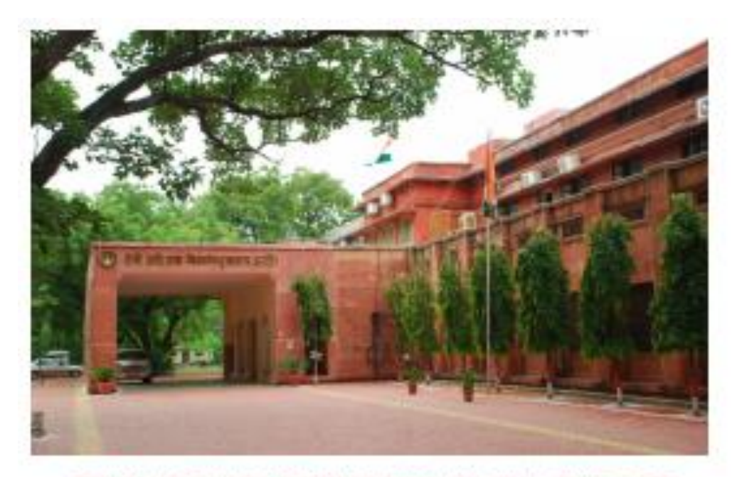
DEVI AHILYA VISHWAVIDYALAYA, INDORE